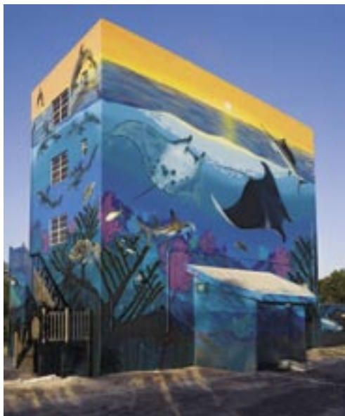
“Whaling Wall” #95: View from Highway 1, northbound.

forged a strong friendship, so wherever he travels throughout America, his paints, brushes and other supplies are transported by National Van Lines. As a result, National Van Lines has dedicated a 48-foot trailer and a 53-foot trailer for Wyland’s use, and in return, he has hand-painted original murals on each. In the past 15 years, these “rolling canvases” have served Wyland and his team in the creation of over 40 Whaling Walls.