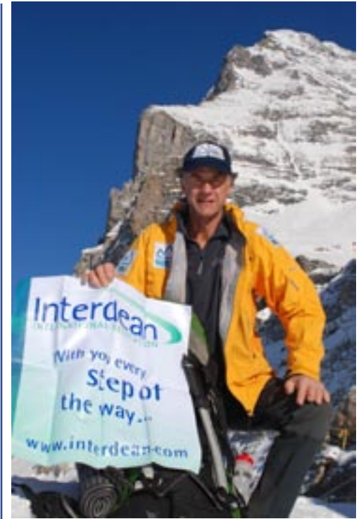
Sir Ranulph Fiennes climbed the Eiger in support of cancer patients.